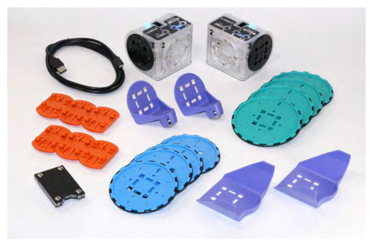
C-STEM Getting Started Bundle